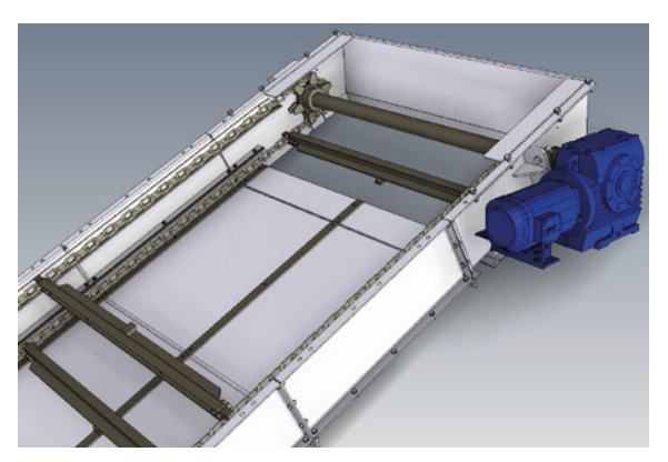
HAZEMAG spillage chain conveyors | HCC

Slide rails are mounted under the apron feeder pans along the length; additional lubrication is not necessary. Furthermore in the input area, additional slide rails are attached in order to absorb shock loads.